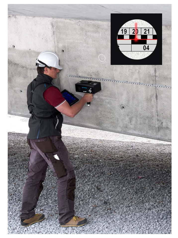
Positioning monitor showing the actual detected position