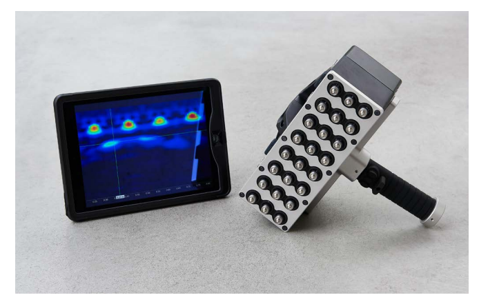
Pundit Live Array Pro wirelessly connected to an iPad