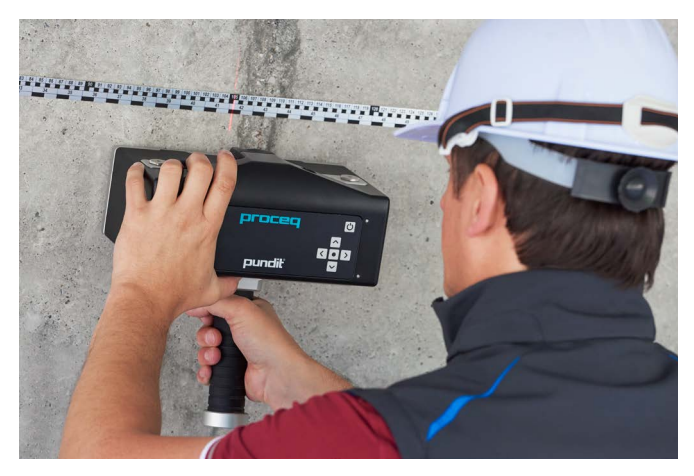
Error-free positioning with the Pundit Live tape measure

Fix the Proceq Live tape measure to the object you need to inspect. Scan wherever you want along the tape and get a perfectly stitched scan! Even if you realize you didn't scan a spot, (shown as blank in the stitched scan) just go back and scan at that location and it will be placed correctly into the stitched scan. The Proceq smart positioning system uses a sensitive, fast CMOS imaging sensor and pattern recognition technologies to detect the position in real-time.